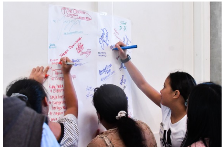
Engaging in activism. Youth signed a scroll in support of Bill 40 which was presented at the hearings for the bill. Bill 40 has since been passed, banning certain single-use plastics on O'ahu.