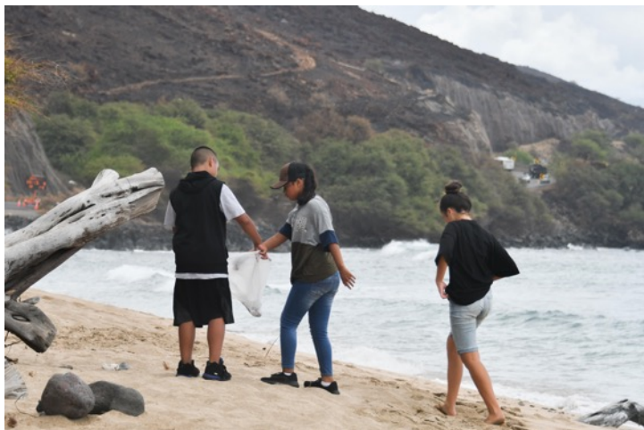
Groups went to different beaches along the highway and did simple and quick beach cleanups.