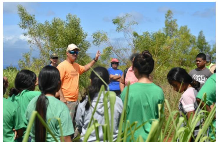
Visit to Pu'u Kukui Watershed Preserve. Youth learned how the mountains and sea are connected and helped to collect seeds that would later be planted to help prevent mud runoff into the ocean.