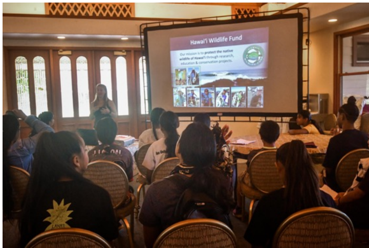
Presentation by Hawai'i Wildlife Fund on marine debris and its effects on the environment. What can we do? 5 Rs (Refuse, Reduce, Reuse, Repurpose, Recycle).