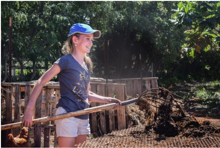
Youth visited Mōhala Farms and learned about composting, permaculture, and even prepared lunch with ingredients from the farm.