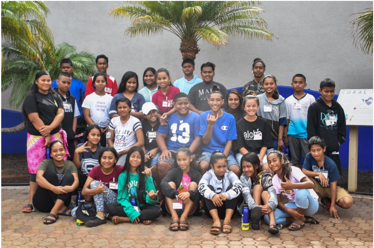
Maui youth participants: 29 youth ranging from grades 6-12, from three different islands (Maui, Lānaʻi, Kauaʻi) and three different churches