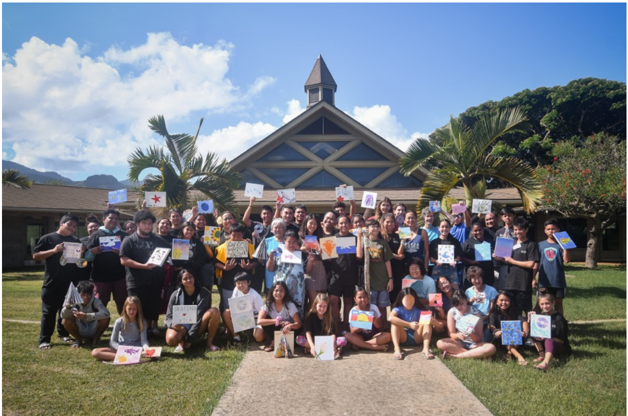
Oʻahu youth participants: 41 youth ranging from grades 6-12, from two different islands (Oʻahu and Kauaʻi) and seven different churches