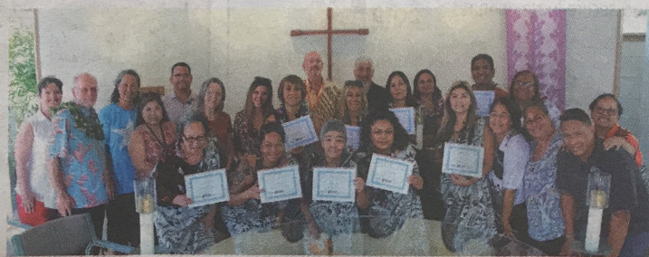
Pū'ā Foundation peer support specialist graduates and their supporters pose for a photo during a Dec. 19, 2019, ceremony.

To volunteer or donate basic necessities to women exiting prison, visit puafoundation.org .