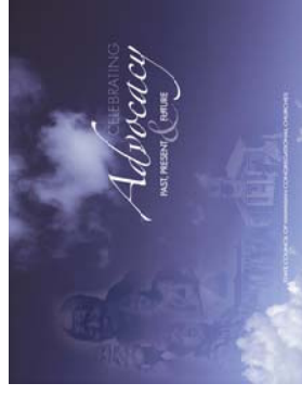
60th Anniversary Commemorative Publication of the State Council of Hawaiian Congregational Churches 1948 to 2008

The Hawaiian Ministry Program ended in 1992 as the Conference re-shaped itself. In that process Hawaiian culture was acknowledged and confirmed as the host culture for the Congregational Church in Hawai'i and the State Council was recognized as advocate for Hawaiian churches. SCHCC serves as a constant reminder of the Hawaiian presence that first embraced and nurtured the Christian faith in these islands.