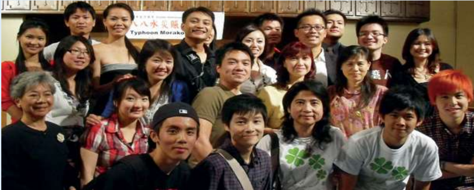
Presbyterian Church in Taiwan Youth mission Program